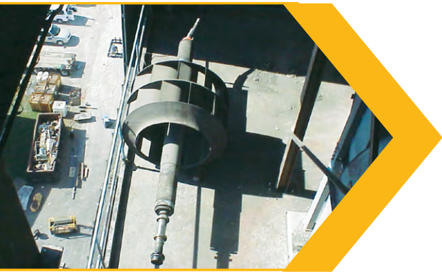
BENT SHAFT & ROTOR (FAN LOCATION 120 FEET ABOVE GROUND)