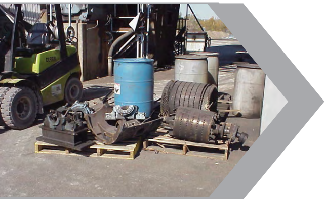
DESTROYED MOTOR & BEARINGS (EXISTING FAN)